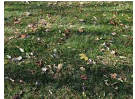
Moderate levels of tree leaves can easily be mulched into a lawn canopy, as shown here.

You've seen the headlines: "A Sharp Spike in Honeybee Deaths Deepens a Worrisome Trend" (NYT, 2015), "The Insect Apocalypse: Our World Will Grind to a Halt Without Them" (The Guardian, 2021), "Ivory-billed Woodpecker, 22 Other Species Declared Extinct by US Government" (CBS News, 2021). Even with some debate around numbers and causes, the trend is alarming, and it's hard to know how to make a difference. But how about a headline like this that addresses the issue?: "Leave the leaves: How doing less yard work helps the environment" (Christian Science Monitor, 2015). How's that for a win-win?