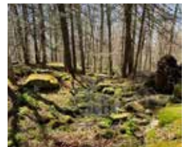
Top: CT Trails Day Hikers.

June's CT Trails Day Hike marked our first community event since the pandemic began, and what a perfect day it was to reconvene with our friends and supporters! The Skidmore Preserve is tucked away on the Litchfield border – a hidden gem, remote even for Warren! Thanks to dedicated WLT Board members and volunteers, and community generosity during the April 2021 "Give Local!" online fundraising campaign, it now sports new trails and a small parking area off Blue Swamp Road.