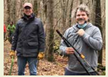
Volunteers on a trail clearing mission!